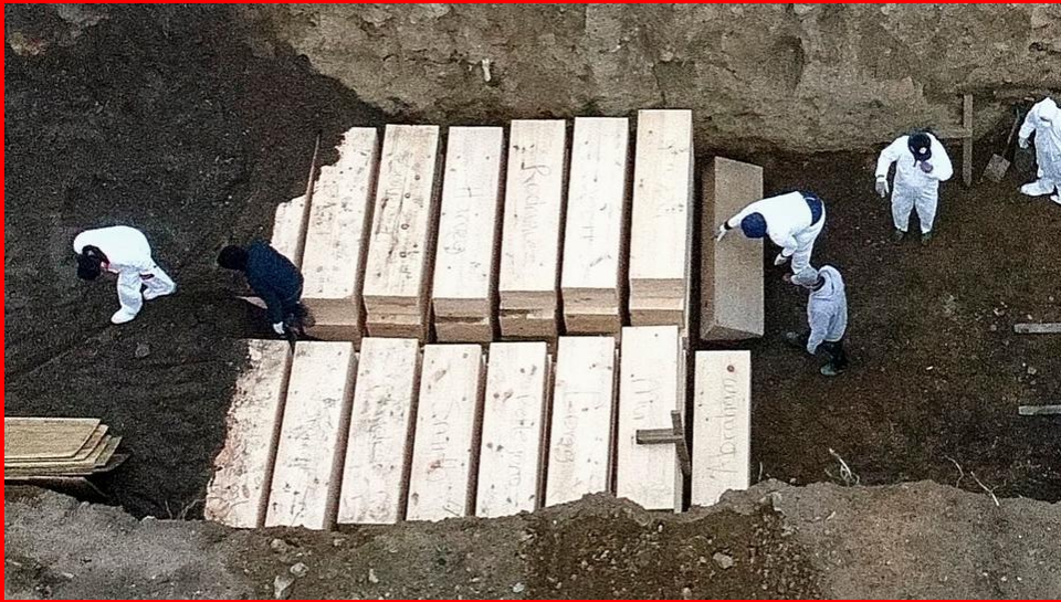
Drone Footage Shows Apparent Coronavirus Mass Grave At New York